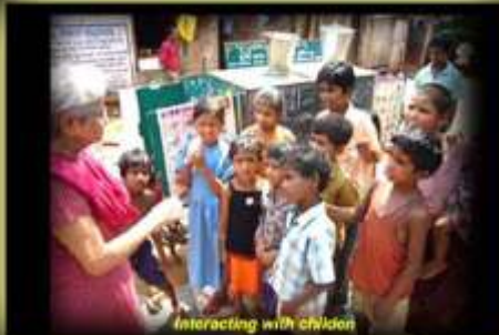
Interacting with children