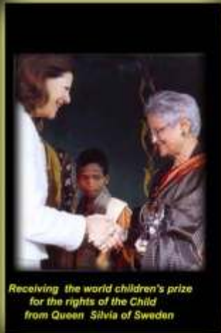
Receiving the world children's prize for the rights of the Child from Queen Silvia of Sweden