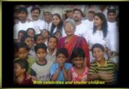
With celebrities and shelter children