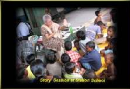
Story Session at Station School