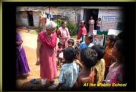
At the Mobile School