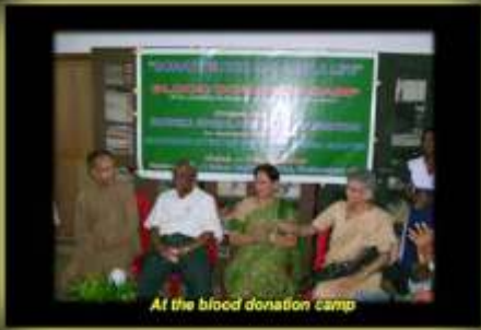
At the blood donation camp