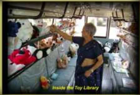
Inside the Toy Library