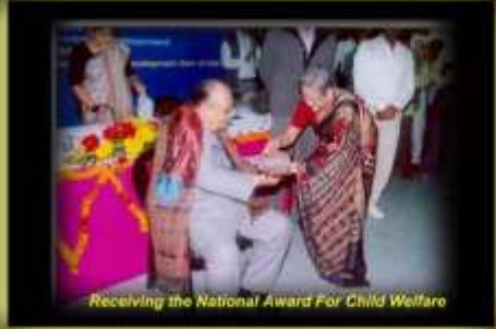
Receiving the National Award For Child Welfare