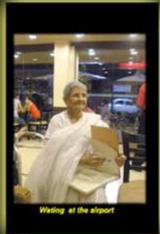
Waiting at the airport

“Every child is important to me irrespective of their economic & social milieu. They are the future. Education for me is the only catalyst which will lead to upward socio-economic mobility”