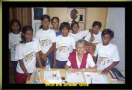
With the Shelter girls